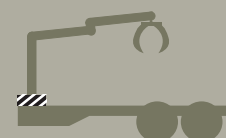
Extended chassis - Crane mounting