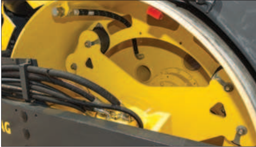
Direct drum drive with vibrating travel speeds of 4.5 mph available. Individually serviceable isolators without drum removal.