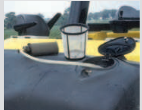
Waterspray system is further protected by fill port strainer and in-tank suction filtration. Fill port cover is lockable for vandal protection.