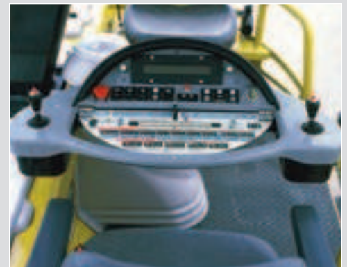
Operator's control panel is fully adjustable to either seating position. Simplified controls make operation easy to novice, as well as experienced operators. Display panel provides all necessary, as well as critical information for proper machine operation and professional results.

With these features and many more, it's easy to see why this model maintains a high residual value while delivering lower lifetime operating costs.