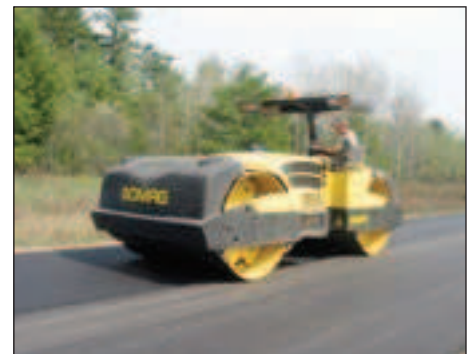
84" rolling width with available 4,000 vpm frequency.