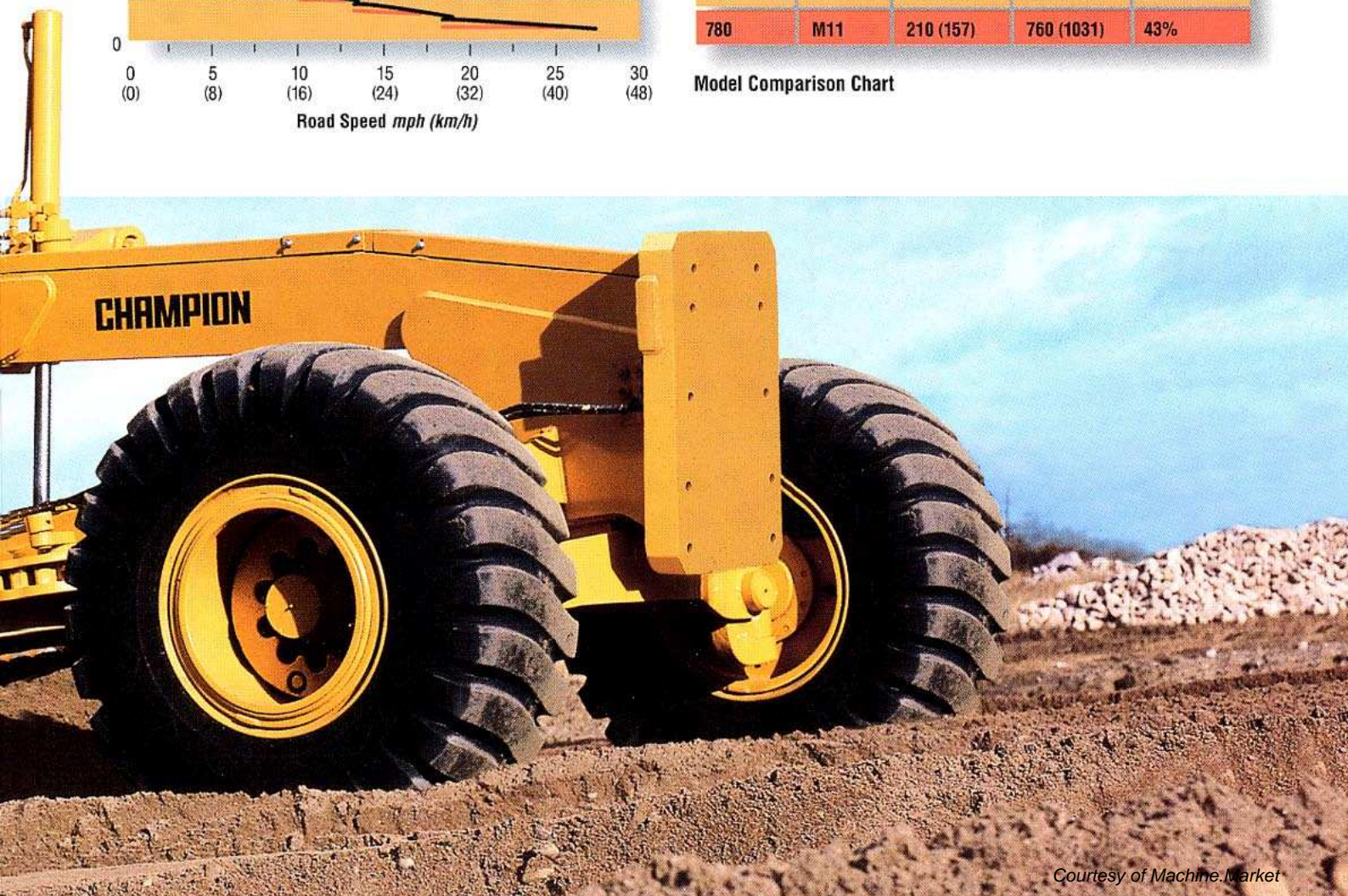
Model Comparison Chart