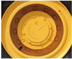
Wheel Rim Mounting Nuts