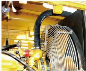
24° cone seal pipe fitting