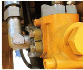
Full Forged Integral Hydraulic Connector