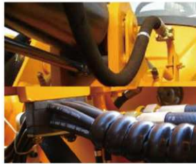
Hydraulic and Brake Systems