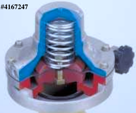
Patented Magnum™ Spray Head