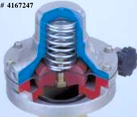
Magnum® Spray Head