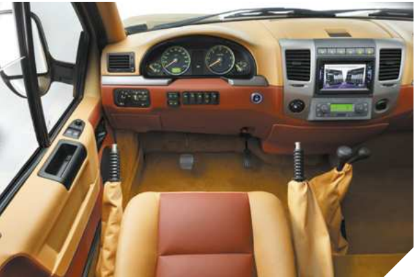
Rugged and reliable controls