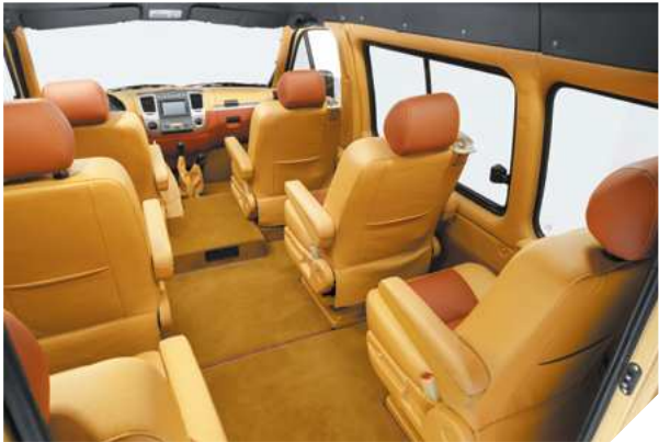
6 seats in the passenger compartment offering outstanding comfort