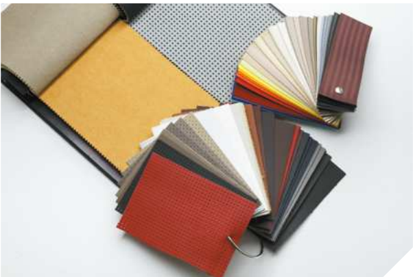
Leather-trimmed interior. Wide selection of colors