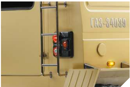
Modular rear lamps