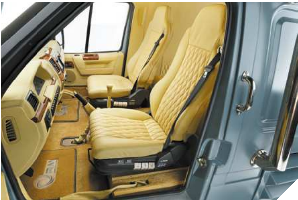
Air-suspension seats with safety belts for ultimate comfort of the driver and front passenger