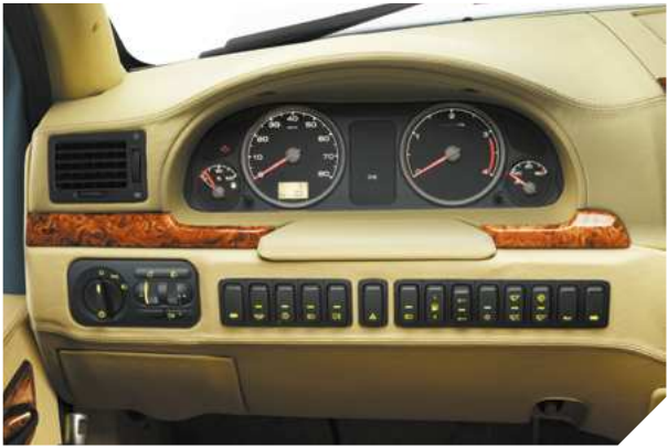
Dashboard protected from direct sunlight featuring backlighting, analog gauges and comfortably positioned control switches