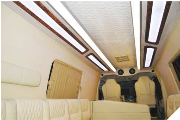
Localized lighting in the passenger compartment