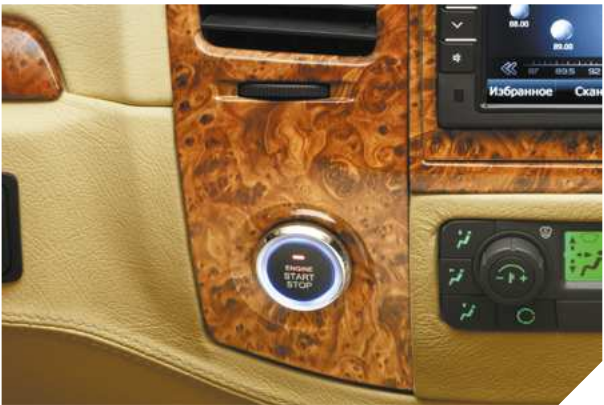
Push-button start technology – Engine Start-Stop System