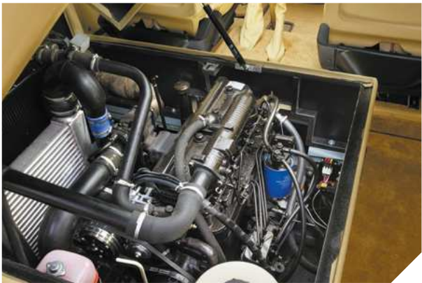
Powertrain. High-performance turbocharged diesel engine (122 hp)