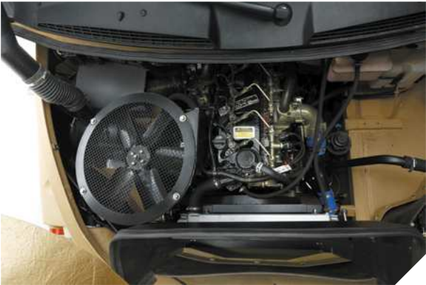
Powertrain. High-performance turbocharged diesel engine (130.5 hp)