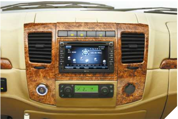
Multimedia system with a touch-screen display, navigation, CD/MP3/DVD