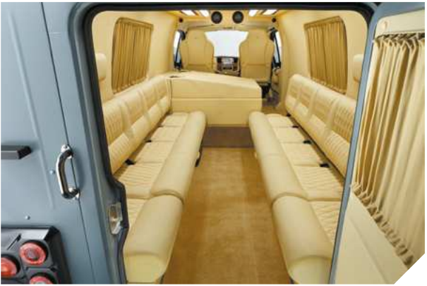
Ergonomic rear passenger seats with safety belts for 5 passengers each. The seats can be positioned transversely (for 1–2 passengers each) while keeping the same overall seating capacity