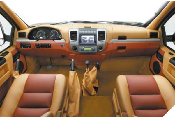
Ergonomic dashboard made of the state-of-the-art material