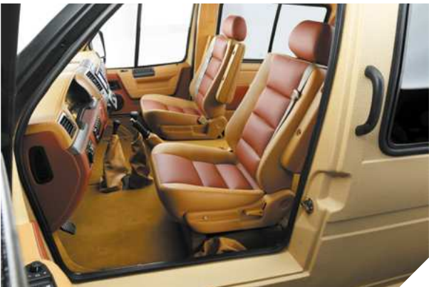
Operator station in the state-of-the-art interior offering excellent visibility