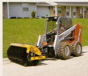
The 19 GPM hydraulic pump delivers plenty of power for optional attachments.