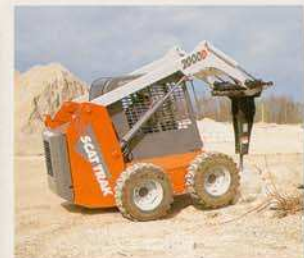
A wide range of versatile attachments are available.