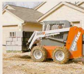
Ideal for construction, industrial, landscape and recycling applications.