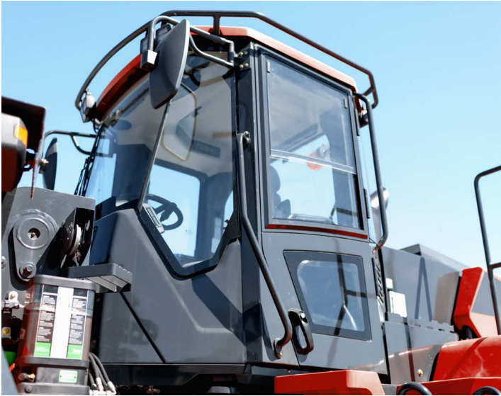
The Taylor T-1045 has been designed to offer optimized visibility. A panoramic view cab with curved front glass has been paired with well-positioned lift arms to allow the operator a clear line of sight to the attachment at ground level.