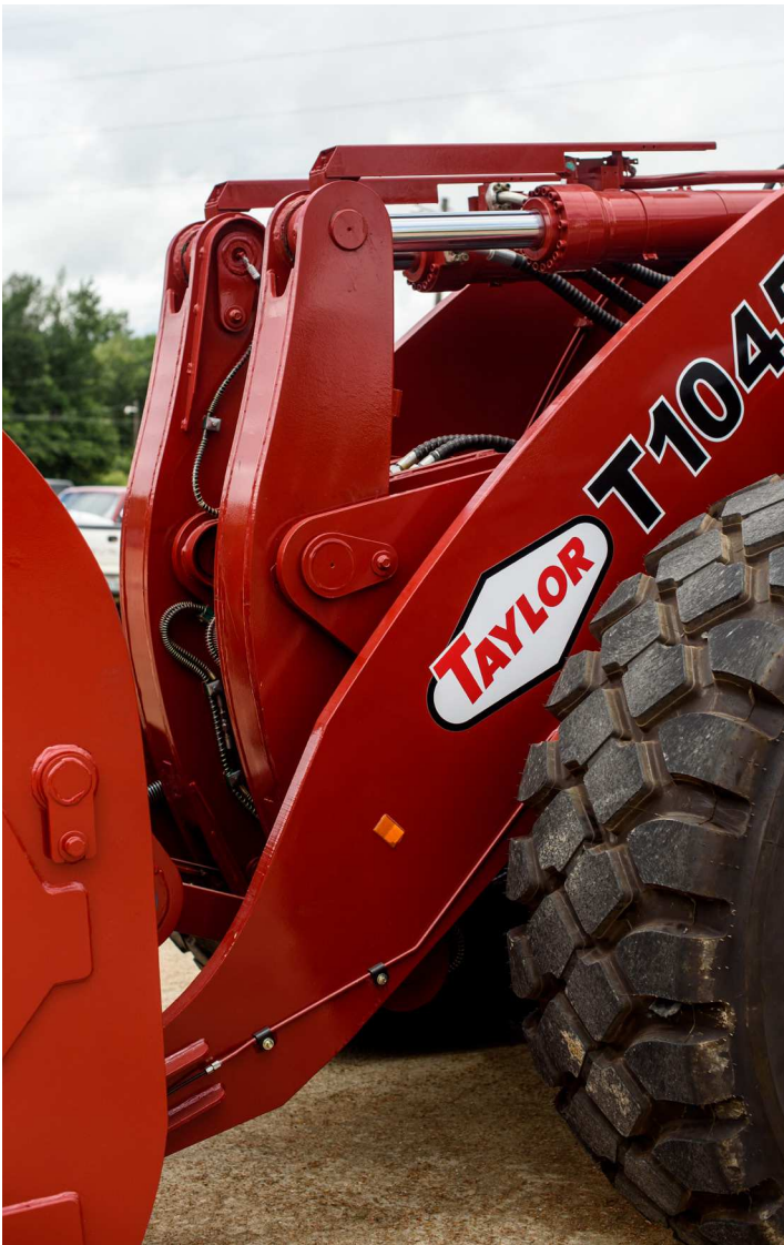
The Taylor T-1045 features optimized Z-Bar geometry that positions the bucket closer to the tires, achieving high bucket breakout forces with maximum rollback. The option of hydraulic quick coupler attachment adds versatility to Z-Bar machines, allowing use of multiple tools to suit the job-site needs.