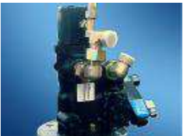
振动泵 VIBRATORY PUMP