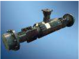
驱动桥 DRIVE AXLE