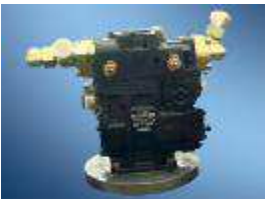
驱动泵 DRIVE PUMP